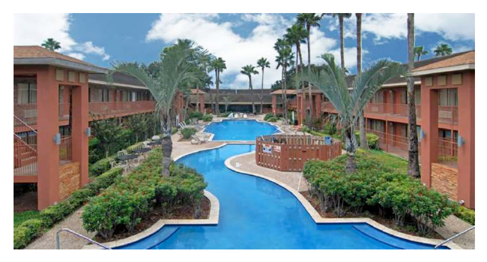
Palm Aire Resort Hotel

(www.bfcs.net) – BCFS is the granddaddy of resettlement for UACs. ORR 2014 grants totaled $280,156,954, strictly for "Residential Services for Unaccompanied Alien Children." One grant alone was over $190 million. BCFS does an astounding amount of work as a government contractor for HHS in many different areas, but this is obviously a growth industry for them. Last summer BCFS earned notoriety as the winner of a $50 million government contract to purchase Palm Aire Resort hotel in Texas and convert it to a 600 bed facility for illegals. The Resort featured indoor and outdoor pools, free Wi-Fi and cable. BCFS abandoned the contract following public outrage.