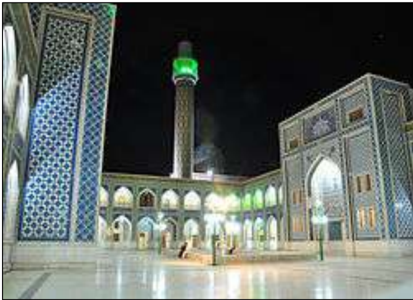
Shi'ite Uwais al-Qarni Mosque in Raqqa