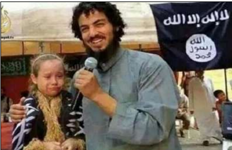
IS man and his newly acquired Yazidi sex slave

Muhammad had sexual relations with Mariyah, his Coptic slave. Mariyah and her sister, Sirin were slaves given as gifts to Muhammad. Muhammad gave Sirin to Hasan Thabit, the poet. Ibn Sa'd says that Muhammad "liked Mariyah, who was of white complexion, with curly hair and pretty." [Taken from Ibn Sa'd's "Kitab al-Tabaqat al-Kabir" (Book of the Major Classes), p151]. 86