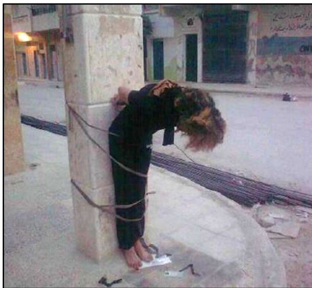
Kurdish woman tied to a pillar in Aleppo, Syria, and left with a note at her feet encouraging passersby to spit on her.

As the demonstrations proliferated and al-Assad's response became increasingly repressive, it did not take long for violence and then war to