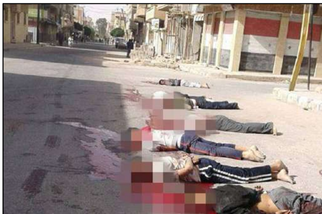
IS PHOTO (EDITED)