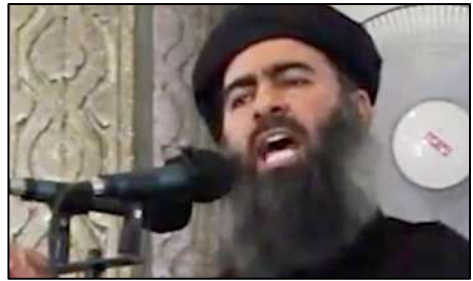
Abu Bakr al-Baghdadi

Little is known about the shadowy figure of Abu Bakr al-Baghdadi (a nom de guerre ), who is also known as Abu Du’a and the “Invisible Sheikh,” 26 but whose real name is Ibrahim Awad Ibrahim Ali Muhammad al-Badri al-Samarri. 27 U.S. State Department records list al-Baghdadi as born in Fallujah, Iraq, in 1971, although other reports put his birth in the Iraqi city of Samarra, which is more likely because of his surname which, according to Middle East custom, indicates the city of his birth. 28 Al-Baghdadi is a highly-educated scholar of Islam, who holds a Ph.D. in Islamic jurisprudence and wears the black turban to signify direct descent from Muhammad.