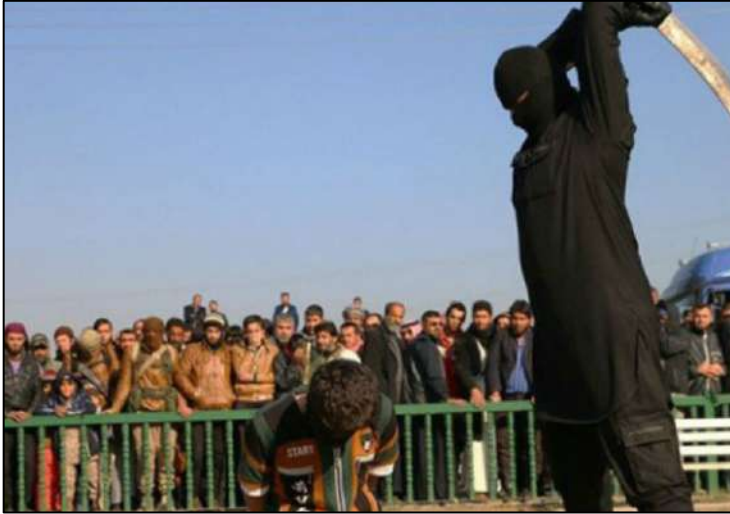
Teenager executed for missing Friday prayers

2016, a sixteen-year-old boy in the same town was arrested by IS' secret police services, also on the charge of heresy, for missing Friday prayers. He, too, was publicly beheaded. 114 On February 19 in the city of Mosul, a 15-year old boy was publicly beheaded outside the main mosque for listening to American popular music on a portable CD player in his father's store. 115