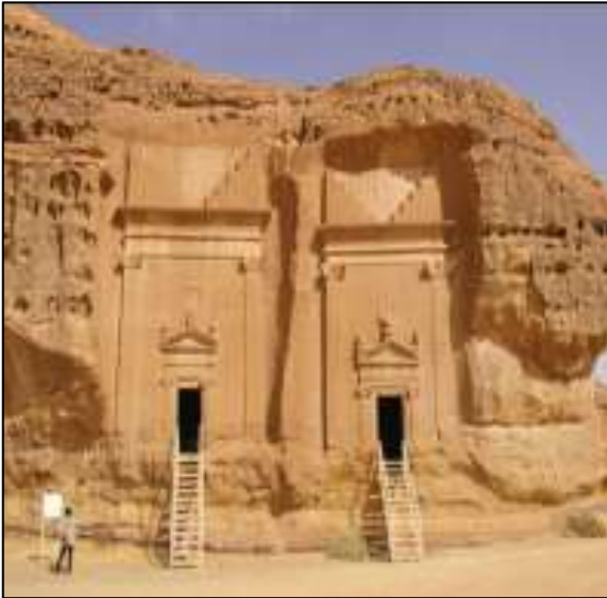
Nimrod before its destruction by IS

Among other priceless treasures destroyed by IS were ancient ruins in the city of Palmyra, another UNESCO World Heritage Site, which dates back nearly 2,000 years. As IS moved closer to the ancient city in May 2015, many