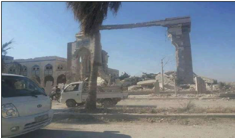
Uwais al-Qarni Mosque after IS destroyed it