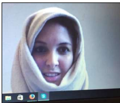
"Maria" from a Skype capture

"While their husbands are out fighting, these women communicate IS's message to the outside world, and particularly to other women curious about the same cause. Because of their youth and Western upbringings, they do so in slang and emoji, intermixed with a handful of Islamic phrases that they have picked up. As the recent widespread distribution of beheading videos on U.S. social media has shown, IS brings plenty of propaganda savvy to its brutal campaign."