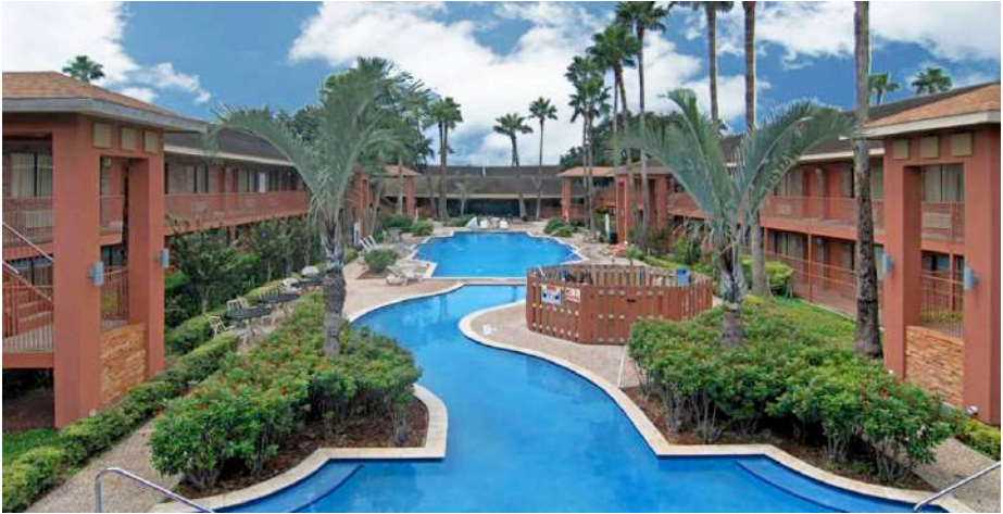
Palm Aire Resort Hotel

(www.bfcs.net) – BCFS is the granddaddy of resettlement for UACs. ORR 2014 grants totaled $280,156,954, strictly for “Residential Services for Unaccompanied Alien Children.” One grant alone was over $190 million. BCFS does an astounding amount of work as a government contractor for HHS in many different areas, but this is obviously a growth industry for them. Last summer BCFS earned notoriety as the winner of a $50 million government contract to purchase Palm Aire Resort hotel in Texas and convert it to a 600 bed facility for illegals. The Resort featured indoor and outdoor pools, free Wi-Fi and cable. BCFS abandoned the contract following public outrage.