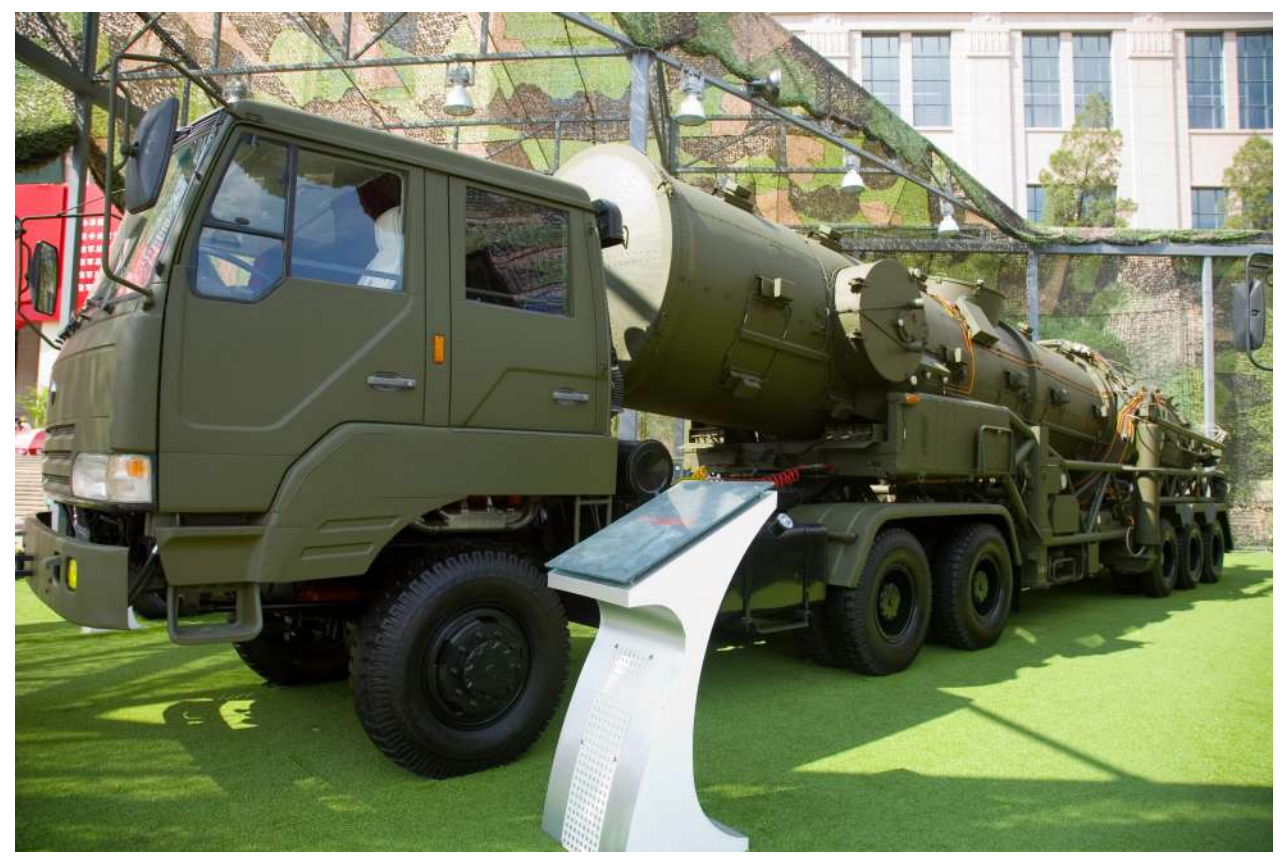
A Chinese DF-21 medium-range ballistic missile on display at the Beijing Military Museum, 2007.

China is now deploying the new nuclear DF-31 and the DF-31A mobile ICBMs, a MIRVed version of their DF-5 silo-based ICBM, the type 094 missile submarines carrying JL-2 SLBMs and H-6J cruise missile carrying bombers.<sup>27</sup>