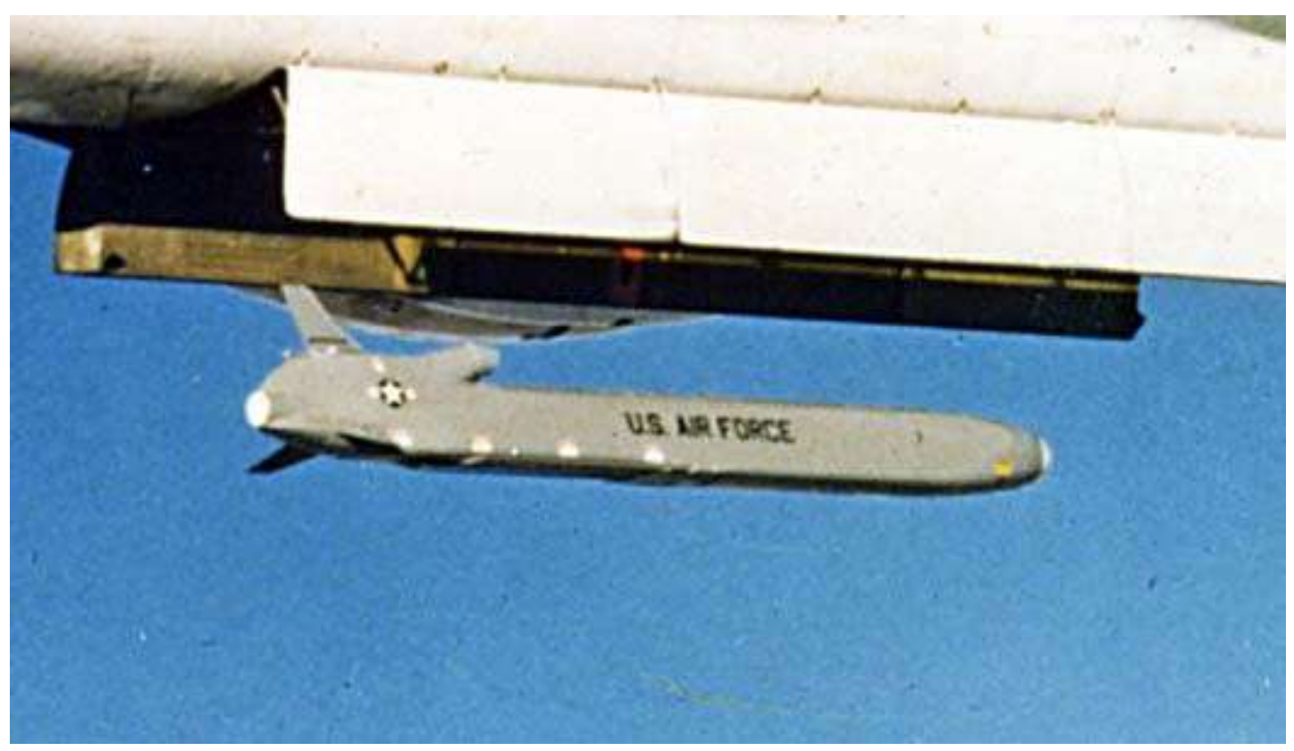
A B-52 launches an AGM/86B Air-Launched Cruise Missile.

against the "risk in our nuclear stockpile."55