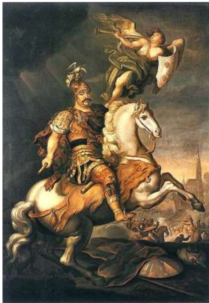
Jan Sobieski.

On September 11, 1683, Polish King John III, a.k.a. Jan Sobieski, i arrived at a hill north of Vienna to break the second great siege of that city by the Ottoman Turks. ii Within hours he led the combined forces of the Crown of the Kingdom of Poland, the Habsburg Monarchy, and the Holy Roman Empire iii in the epochal battle at the gates of Vienna, during which Sobieski led the largest cavalry charge in world history, iv ultimately routing a 150,000-man Ottoman army about twice the size of his own, v after which, according to one historian, “the Ottoman Turks ceased to be a menace to the Christian world.” vi