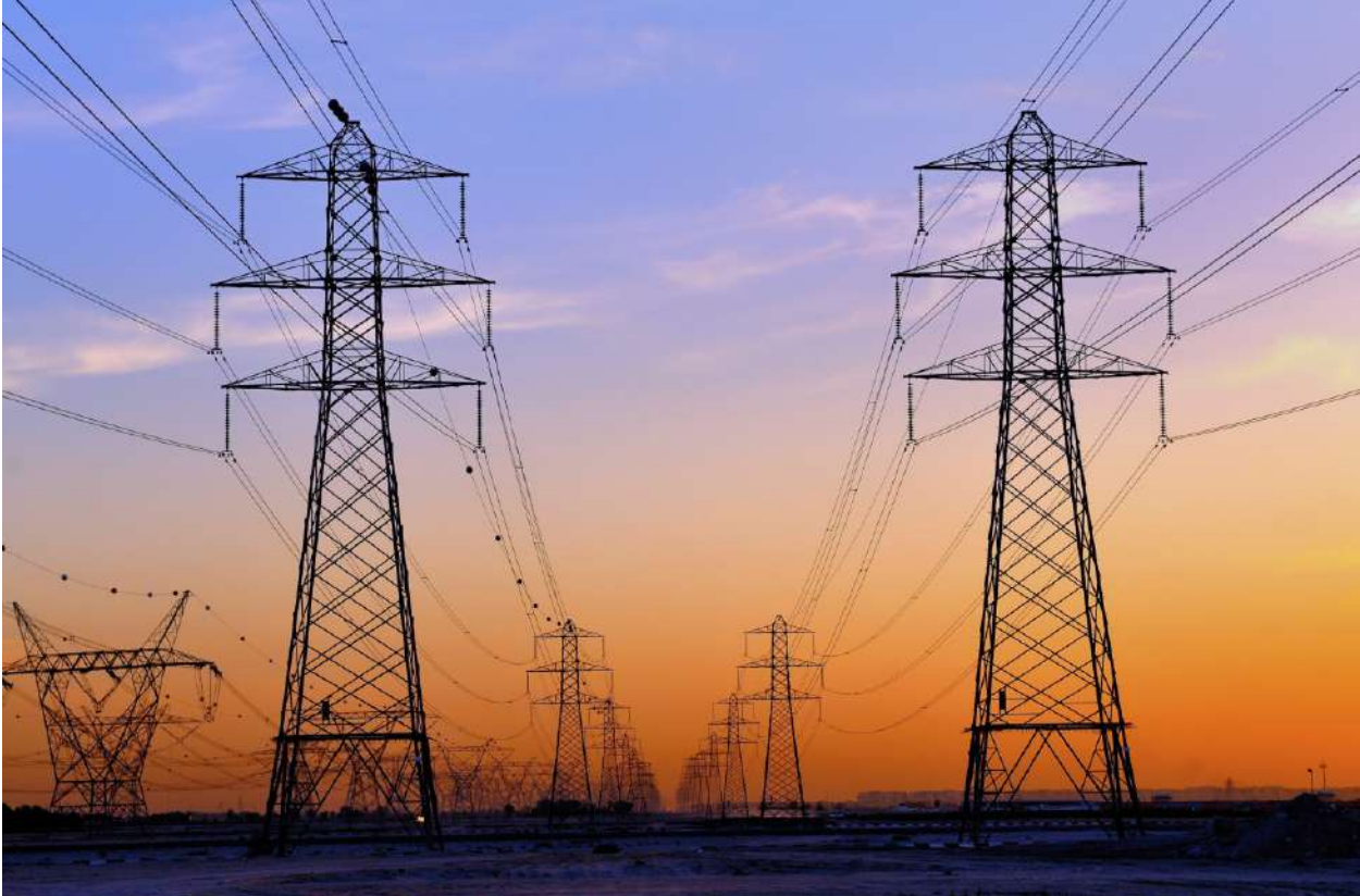
Power transmission lines.

U.S. Air Force Brigadier General James R. McCarthy (Ret.) 1 commanded a wing of Strategic Air Command (SAC) B-52s during the height of the Cold War that kept American nuclear weapons airborne, encircling Russia twenty-four hours per day -- for decades. The B-52s comprised one leg of America's "nuclear triad" of bombers, submarines, and missile silos that relentlessly maintained around-the-clock deterrence against a Soviet preemptive nuclear attack on the United States.