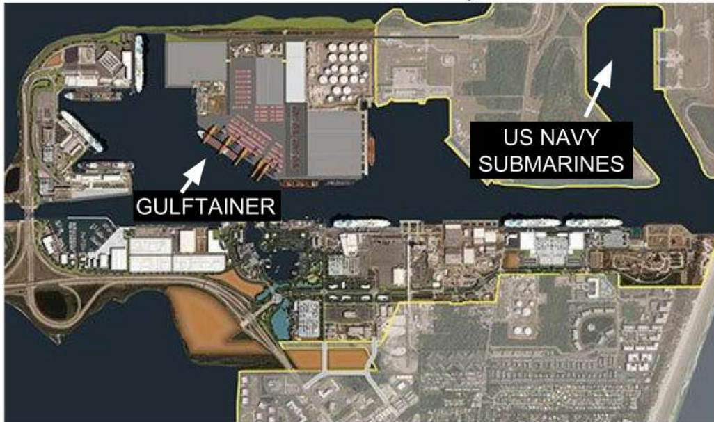
Map of Port Canaveral, Florida